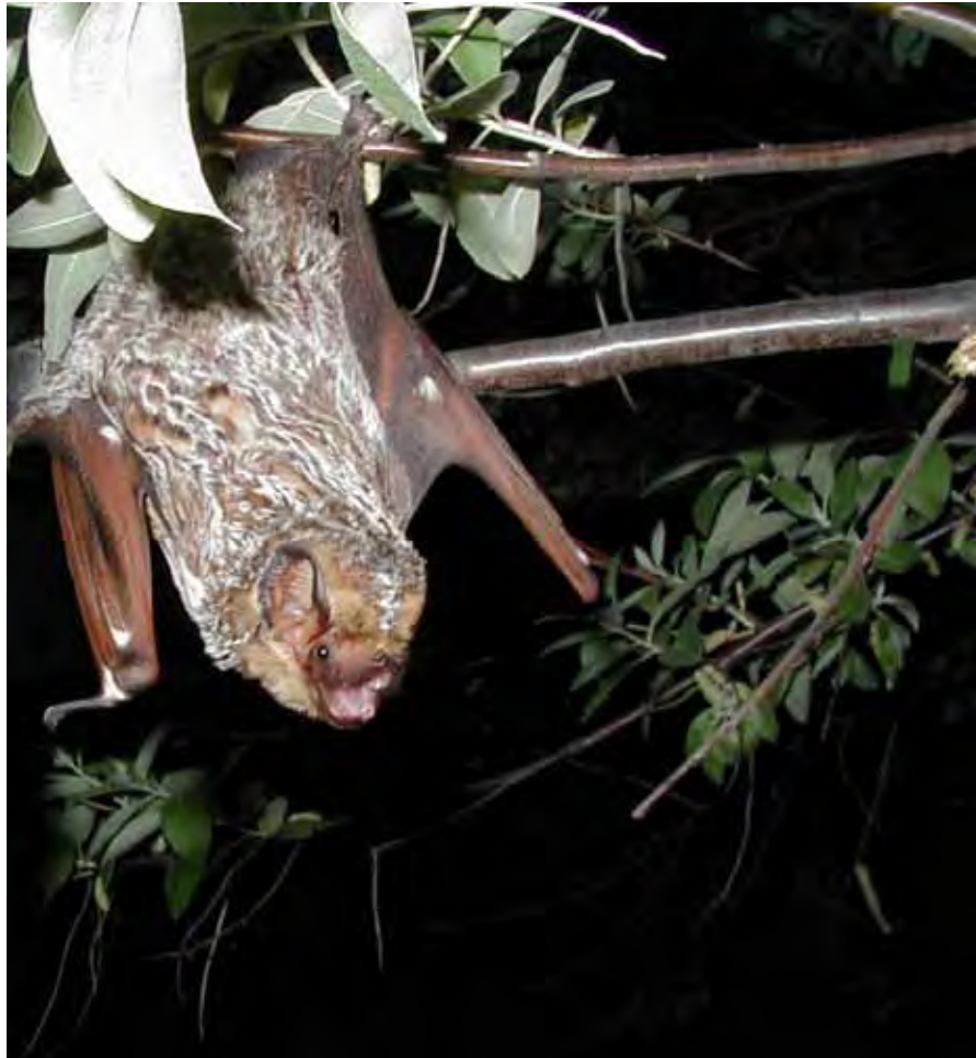
Hoary bat.

The commonly used data collection methods for estimating the spatial distribution and relative abundance of diurnal birds includes counts of birds seen or heard at specific survey points (point count), along transects (transect surveys), and observational studies. Both methods result in estimates of bird use, which are assumed to be indices of abundance in the area surveyed. Absolute abundance is difficult to determine for most species and is not necessary to evaluate species risk. Depending on the characteristics of the area of interest and the bird species potentially affected by the project, additional pre-construction study methods may be necessary. Point counts or line transects should collect vertical as well as horizontal data to identify